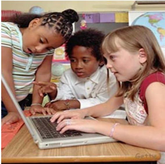
DISTRICT OF COLUMBIA OFFICE OF THE STATE SUPERINTENDENT OF EDUCATION