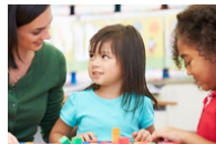
Teaching with Intention