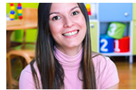
Program & Classroom Assessment