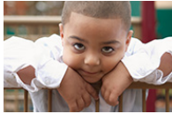
Dual Language Learners