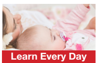
Learn Every Day Growing Language for Infants & Toddlers