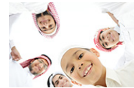
Honoring All Families