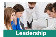
Leadership Implementing Quality Teams