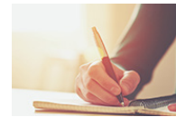
The Reflective Teacher