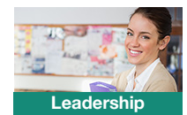
Leadership Teacher Leadership Teams