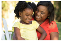
Building Positive Relationships