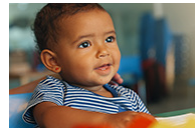
The Developing Infant & Toddler