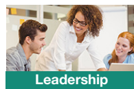
Leadership Foundations of Quality Teams