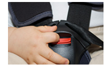
Traveling with Precious Cargo