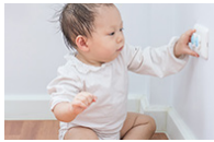
Keeping Our Children Safe