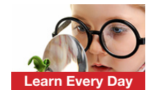
Learn Every Day Foundations for Learning Every Day