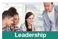
Leadership Essentials of Leadership