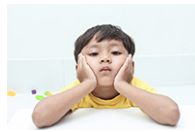
Challenging Behavior: Reveal the Meaning