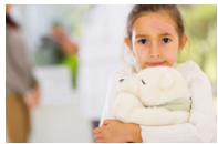
Safe Spaces & Places to Grow & Learn