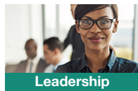
Leadership Administrative Leadership