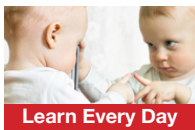
Learn Every Day Learning Every Day Through the Senses