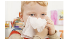
Cut the Cooties! Communicable Disease Prevention