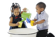
Foundations of Curriculum