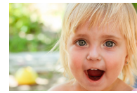
Child Language Development And Signs Of Delay