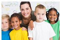
The Juggling Act: Schedules, Routines, and Transitions