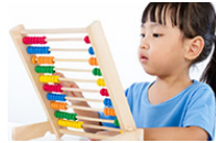
STEM in Preschool Classrooms