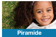
Piramide Exploring the Piramide Approach