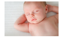
Safe Sleep and Sweet Dreams for Infants