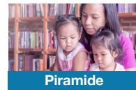
Piramide Interactive Storytelling