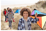
Building Strong Relationships with Families