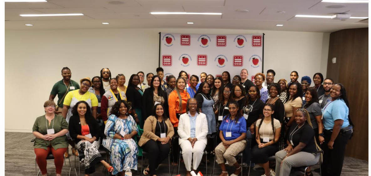
Signing Day, August 2024