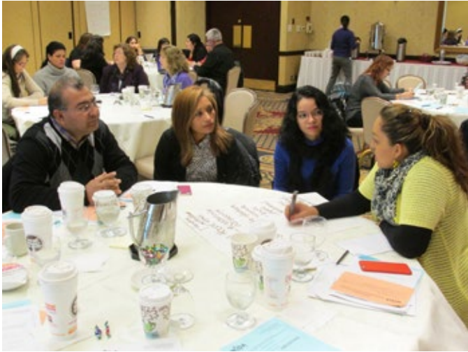
Teams of Illinois parents, parent leaders, and educators came together in October 2014 to discuss family engagement practices focused on English language learners.