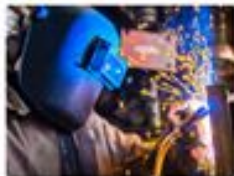
Manufacturing Contextualized Curriculum