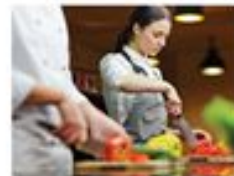
Hospitality Contextualized Curriculum