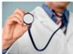
Healthcare Contextualized Curriculum