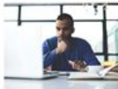
Digital Literacy Contextualized Curriculum