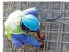
Construction Contextualized Curriculum