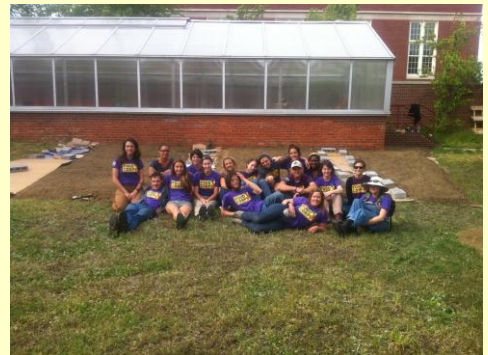
Much deserved rest after heavy lifting at Eastern HS Food Corps Service Day

DC Environmental Literacy Plan public meetings : The Healthy Schools Act of 2010 prioritizes the health and wellness of students throughout the District and also asserts that the environment plays a central role in supporting learning outcomes and maintaining life-long healthy behaviors. The Healthy Schools Act calls for an environmental literacy plan (ELP) for the District – a road map that will lay the foundation for District-wide implementation and integration of environmental education throughout the K-12 curriculum. The District Department of the Environment (DDOE) will release the DC Environmental Literacy Plan and hold public meetings during the 21-day public comment period beginning May 11, 2012. To download the DC ELP and view the public meeting schedule, visit www.ddoe.dc.gov . All comments are due no later than Thursday, May 31, 2012, and can be emailed to environmental.literacy@dc.gov .