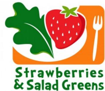
Strawberry and Salad Greens id May 23 rd sign up today!

The Farm Fresh Feature for May is the Strawberry! Click here for a planting calendar.